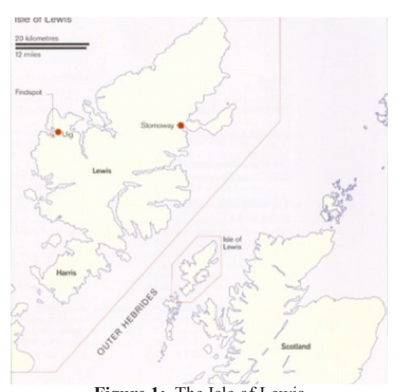
Figure 1: The Isle of Lewis

The brochure from the British Museum states that the chessmen were probably crafted in Trondheim, Norway, but their actual origin remains unknown. Various theories mention Iceland, Norway or Scandinavia, Scotland, Ireland, or England as possibilities.<sup>2</sup> Most of the pieces are carved from walrus tusks (some of them from whale's teeth), and they are thought to have been made between 1150 and 1200.<sup>3</sup>