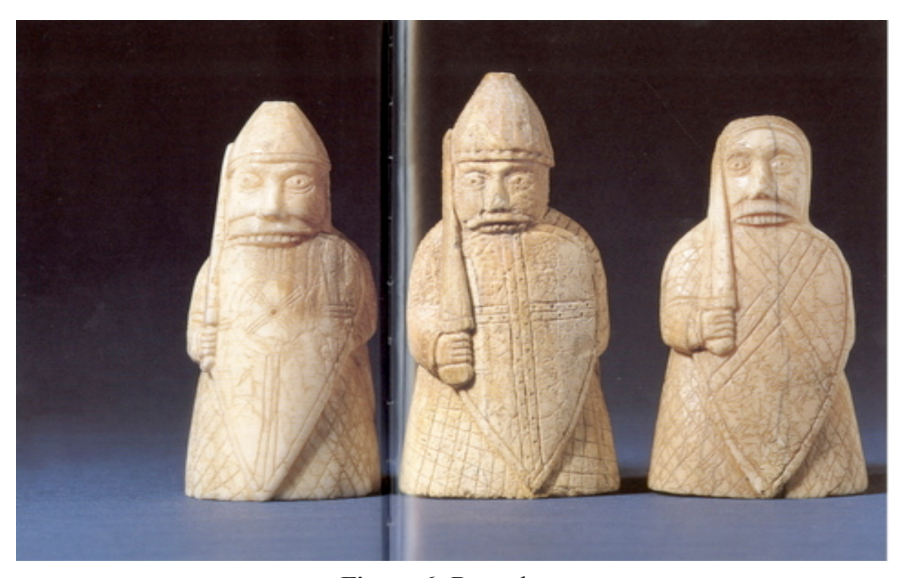
Figure 6: Berserkers

In Scandinavia and Germany, this chess piece is called "tower", Swedish torn , Danish tårn . English and Icelandic speak of a rook ( hrókur ). Berserkers seem to figure nowhere except among the Lewis chessmen.