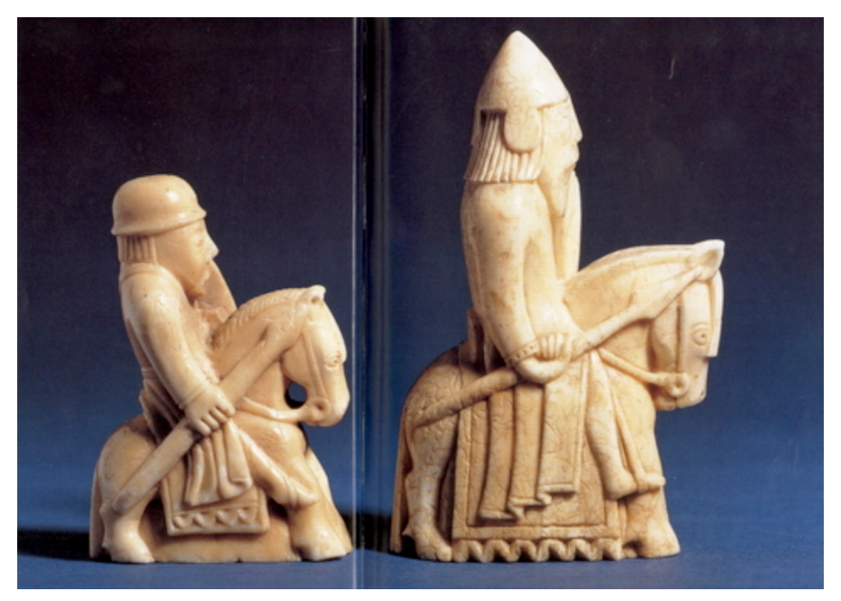
Figure 7: Knights