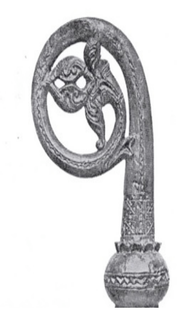
Figure 2: The head of the Greenland crosier