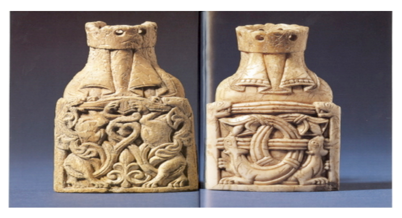
Figure 3: The queens, seen from behind